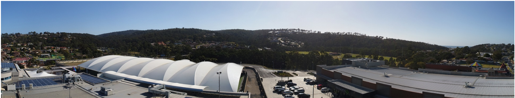
Figure 11 Same direction as figures 7 and 9 but at 6 th floor