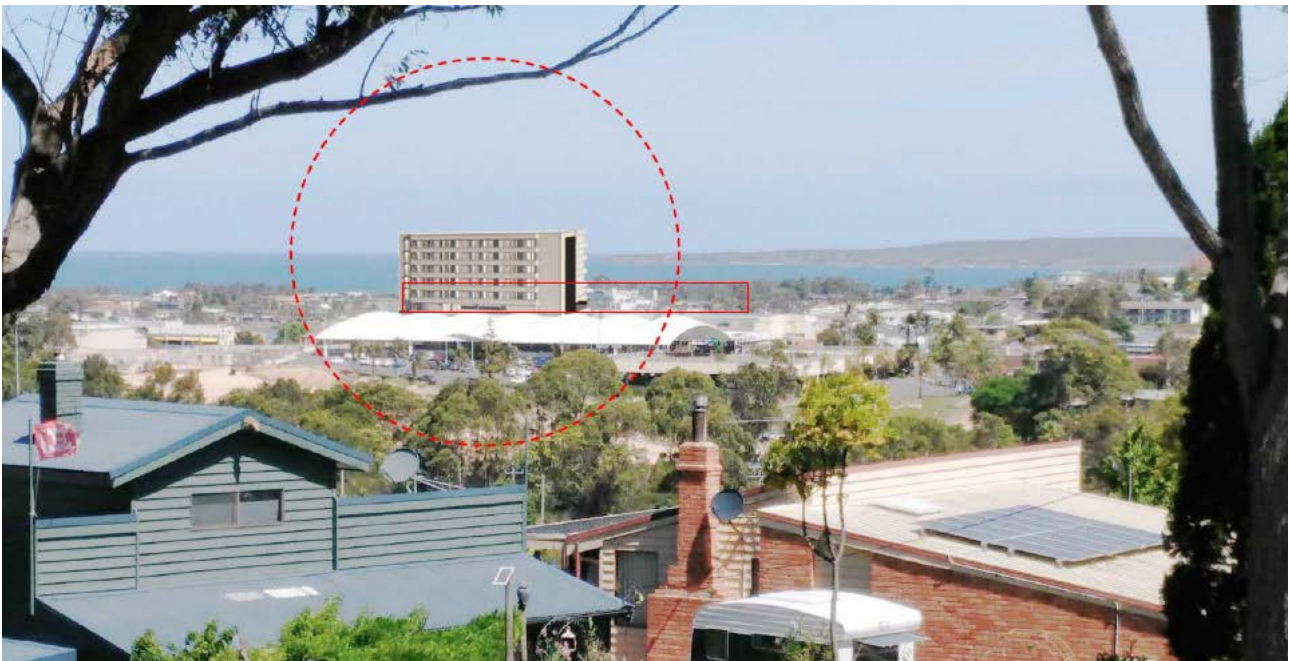
Figure 1 In this image, the hotel tower is prominent and obscures perhaps 30% of a moderate water view. But the red outline is of a bulky building to the current 16 metre height and it is probably more a decision of taste which has more impact.

The recent reviews of height controls in Merimbula have now set a pattern where the skyline from various vantage points will eventually have buildings of greater bulk. In this new context and vision for merimbula the hotel tower is taller but more slender and of specific interest.