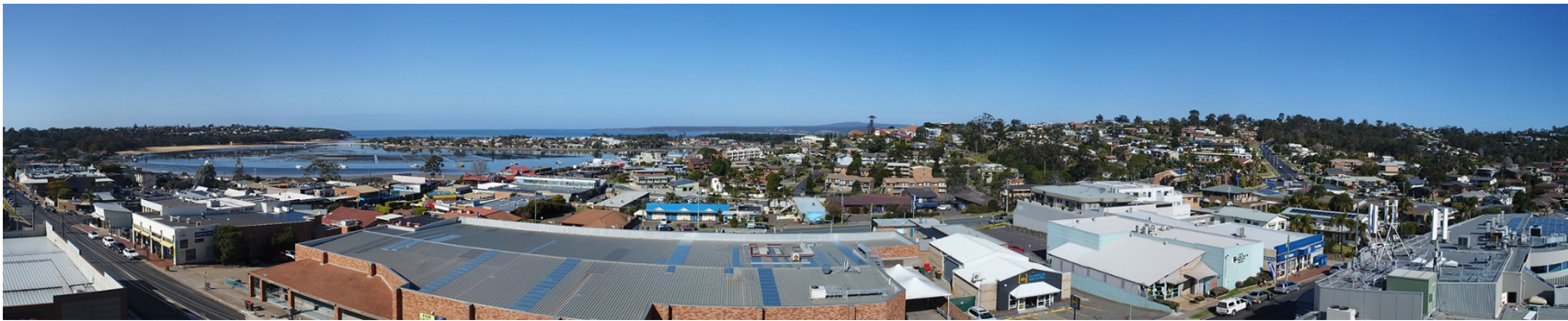
Figure 10 Same direction as figures 6 and 8 but at 6 th floor

Notes: this would be the top floor rooms. Views are excellent.